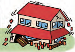
Low earthquake resistance

Based on its risk management plan, Kyoto University is implementing measures such as enhancing the earthquake-resistance of existing buildings and stockpiling food and drinking water. It is also important for individuals to take their own precautions in preparation for earthquakes, in order to minimize potential damage.