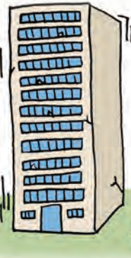
High earthquake resistance