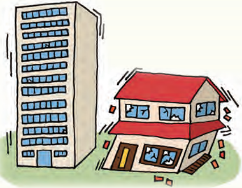
High earthquake resistance

* Other premises and facilities are dealt with in accordance with the disaster plans of their relevant municipal governments.