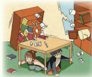
Low earthquake resistance